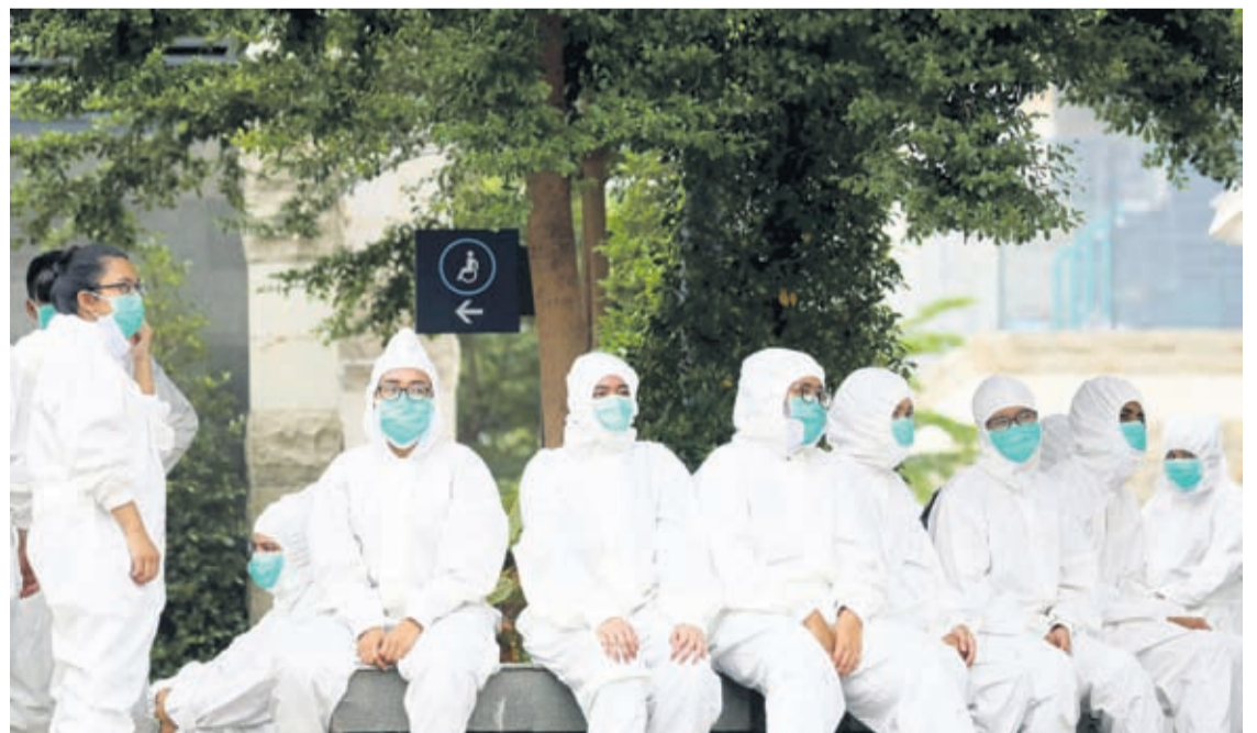
Medical workers take a break at a coronavirus mobile test site in Jakarta, Indonesia, Wednesday, May 6, 2020.